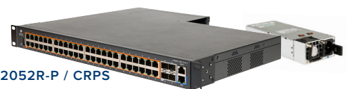
EX2052R-P / CRPS